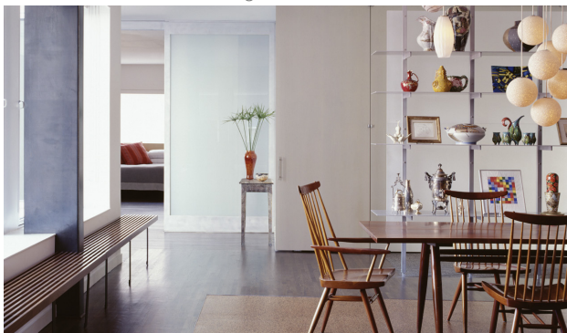
Dining area with master bedroom

The clients - he runs his own advertising agency, she curates American art - were looking for a home that would function at different scales: as a work space and a space to entertain, but at the same time a space which is tempered by the practicality of family life and raising a son. The apartment is an expression of the couple's fascination with china, modern art, eclectic furniture and storage, fused with their passion for color, pattern and detail.